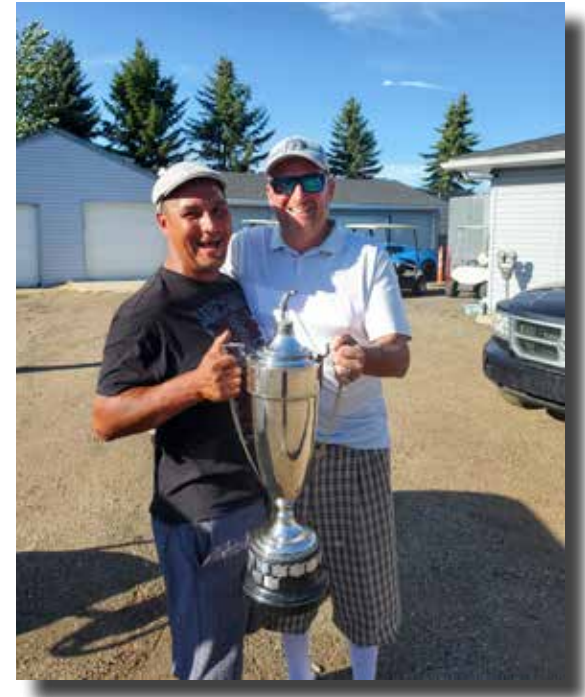
Looks like everyong wanted a piece of the Canadian Open Trophy!